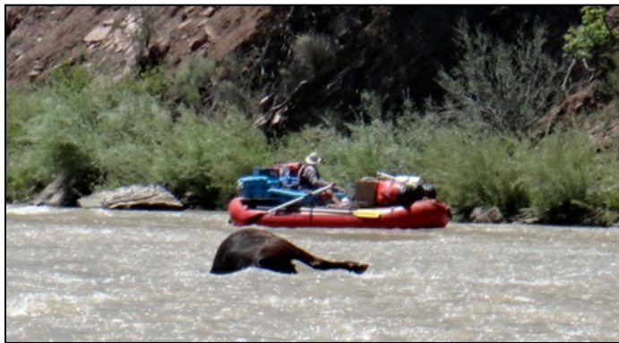
The Project Reach saw its heaviest summer grazing in many years as livestock were moved into the canyon from parched uplands. Some five dead cows ended up in the river, to the dismay of range managers and recreationists.