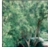
New Mexico Olive

Here's a very small sampling of low-water-use trees that grow in the three major climate zones in the Land of Enchantment.