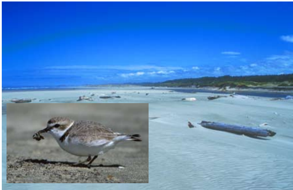
The Oregon Parks and Recreation Department has a habitat conservation plan to support the recovery of the western snowy plover by controlling invasive beach grass; managing predators such as crows, ravens, foxes, coyotes, and raccoons; and shifting activities such as dog-exercising and kite-flying away from the birds and their nests, eggs, and chicks. The Department has a 25-year incidental take permit for occasions when recreation inadvertently harms the threatened species. Western snowy plover photo by David S. Pitkin; habitat photo by Kathleen Castelein, Oregon Biodiversity Information Center.

For endangered species, permits may be issued for scientific research, enhancement of propagation or survival, and taking that is incidental to an otherwise lawful activity.