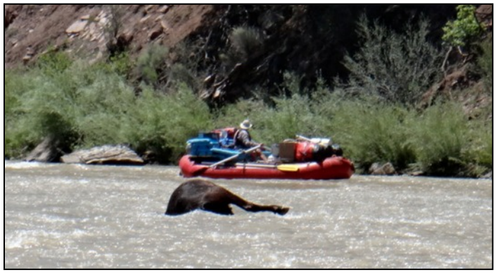
The Project Reach saw its heaviest summer grazing in many years as livestock were moved into the canyon from parched uplands Some five dead cows ended up it the river, to the dismay of range which we monitor managers and recreationists.

Todd Caplan and Greg Gustina reported the results of the baseline study on the hydrology-geomorphology,