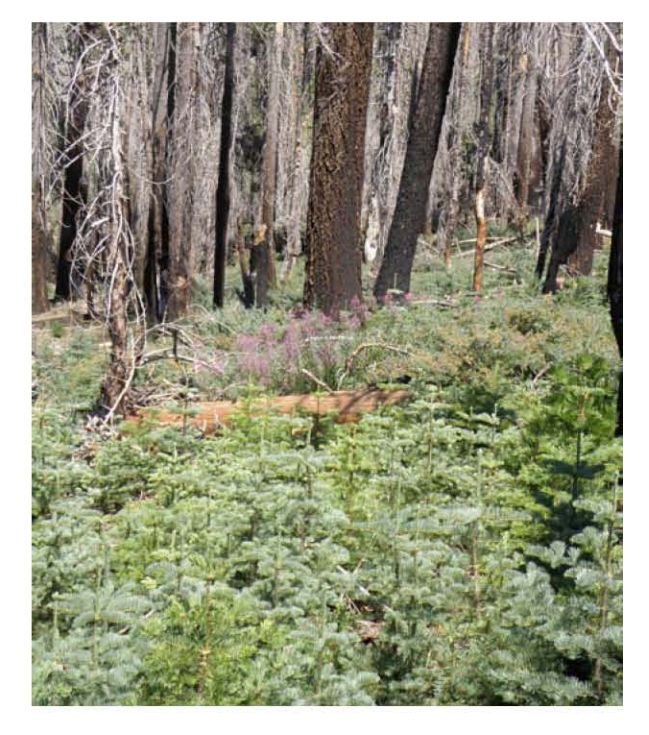
Fig. 9. Natural conifer regeneration in an area of nearly 100% mortality from fire.