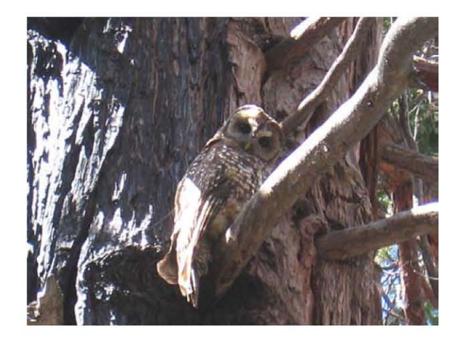
Fig. 7. A California Spotted Owl roosting in a burned area within the McNally fire, Sequoia National Forest.

Interestingly, over four years of study in three fire areas, only one Barred owl was found within burned forests, while many were found just outside the fire perimeter