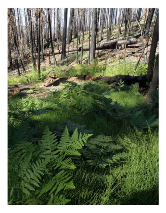
Fig. 13. Understory vegetation in a recent snag forest patch.

The living and dead plant material in a forest is called biomass. This includes everything from the small diameter branches, trees, and shrubs up to the old-growth trees. Today we are seeing increasing aggressive calls - mostly from the timber industry and their political allies - to remove biomass from the forest ostensibly to reduce fire effects. This biomass logging removes trees from the forest to be burned in energy production facilities. However, as discussed above, we remain in a major fire deficit, and snag forest habitat, created by patches of high-intensity wildland fire, is one of the rarest and most endangered habitat types in western U.S. conifer forests; and it is also one of the most ecologically important and biodiverse forest habitat types. Forest management policies designed to further reduce this imperiled habitat would further exacerbate its current deficit, which is