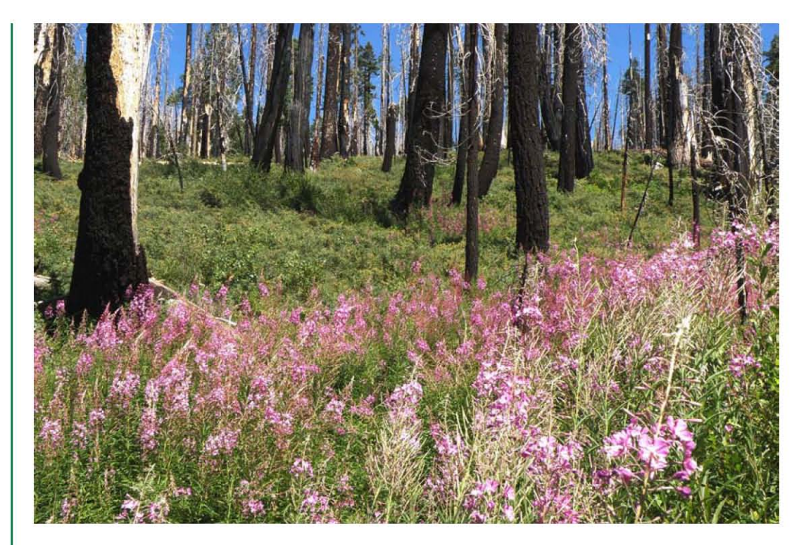
Figure 1. Snag forest habitat in a mature mixed-conifer forest.

In snag forest habitat, countless species of flying insects are attracted to the wealth of flowering shrubs which propagate after stand-transforming fire – bees, dragonflies, butterflies, and flying beetles. Many colorful species of birds, such as the iridescent blue Mountain Bluebird, nest and forage in snag forest habitat to feed upon the flying insects. In order to feed upon the larvae of bark beetles and wood-boring beetles in fire-killed trees, woodpeckers colonize snag forest habitat shortly after the fire, excavating nest cavities in large snags. The woodpeckers make new nest holes each year, leaving the old ones to be used as nests by various species of songbirds. Many rare and imperiled bat species roost in old woodpecker cavities in large snags, and feed upon the flying insects at dusk. Small mammals, such as snowshoe hares and woodrats, create dens in the shrub patches and large downed logs, and raptors, such as the Spotted Owl, benefit from the increase in the abundance of their prey. Deer and elk browse upon the vigorous new plant growth that follows stand-transforming fire, and bears and wolves benefit from the increased abundance of their prey as well. A number of native wildlife species, such as the Black-backed Woodpecker, are essentially restricted to snag forest habitat for nesting and foraging. Without a continuous supply of this habitat, they won't survive.