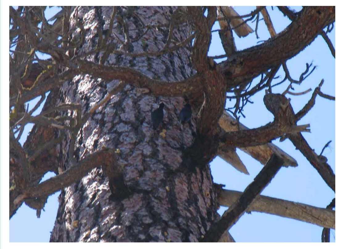
Fig. 11. Black-backed Woodpeckers (center of image) foraging on a large snag.

Due in large part to the combined effects of fire suppression and post-fire logging, large snags (dead trees) are currently in severe deficit, contrary to popular belief. For example, recent U.S. Forest Service Forest Inventory and Analysis (FIA) data, using 3,542 fixed plots throughout California, shows that there are less than 2 large snags per acre in all forested areas (Christensen et al. 2008). The Sierra Nevada Forest Plan Amendment recommends having at least 3-6 large snags per acre to provide minimum habitat for the needs of the many wildlife species that depend upon large snags for nesting and foraging (USDA 2001, 2004). Some species need even higher densities of large snags, such as the California Spotted Owl, which prefers to have at least 20 square feet per acre of basal area in large snags (about 6-8 large snags per acre) to maintain habitat for its small mammal prey (Verner et al. 1992). Other species require much higher densities of large snags, such as the Hairy Woodpecker and Black-backed Woodpecker (Hanson 2007a, Hanson and North 2008).