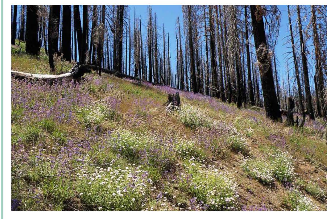
Figure 3. Recent snag forest habitat in the Sierra Nevada.

"Snag forest habitat", resulting from high-intensity fire patches (generally, stands with 75-80% or greater tree mortality from fire, exclusive of seedlings and saplings) that have not been salvage logged, is one of the most ecologically-important and biodiverse forest habitat types in western U.S. conifer forests (Lindenmayer and Franklin 2002, Noss et al. 2006, Hutto 2008). Noss et al. (2006) observed the following in reference to high severity fire patches: "Overall species diversity, measured as the number of species – at least of higher plants and vertebrates – is often highest following a natural stand-replacement disturbance..." Snag forest habitat is comprised of abundant standing fire-killed trees ("snags") of all sizes, especially larger trees, as well as patches of montane chaparral (dominated by flowering shrubs whose germination is facilitated by fire), dense pockets of natural conifer regeneration, large downed logs, numerous "fire-following" wildflowers, and widely-spaced large surviving trees. At the landscape level, high-intensity fire habitat (when it is left unlogged) is among the most underrepresented, and rarest, of forest habitat types. Noss et al. (2006) observed that "early-successional forests (naturally disturbed areas with a full array of legacies, ie not subject to post-fire logging) and forests experiencing natural regeneration (ie not seeded or replanted), are among the most scarce habitat conditions in many regions."