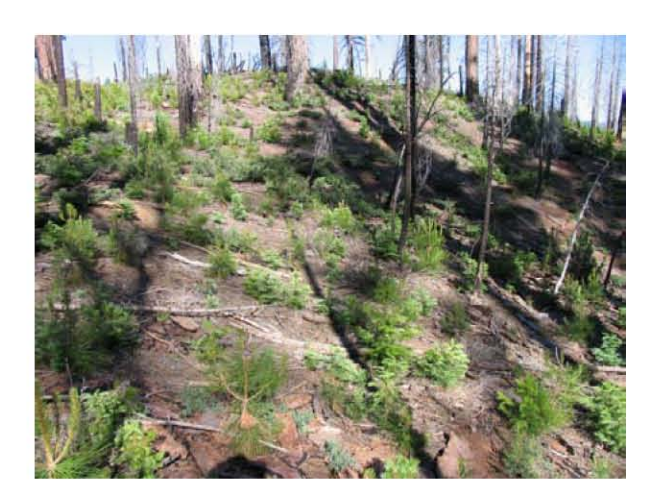
Fig. 8. Natural conifer regeneration in a high-intensity patch of mixed-conifer forest.

In the few places wherein post-fire conifer regeneration does not quickly occur, these areas provide important montane chaparral habitat, which has declined due to fire suppression (Nagel and Taylor 2005). As noted earlier, montane chaparral provides key habitat for a variety for shrub-dwelling species like the Snowshoe Hare and the Blue Grouse, which nests and forages within the shrub growth. The Dusky-footed Woodrat also inhabits these areas, which in turn provides food for the Spotted Owl. Likewise, ungulates, such as deer and elk, forage upon the shrubs, and their predators