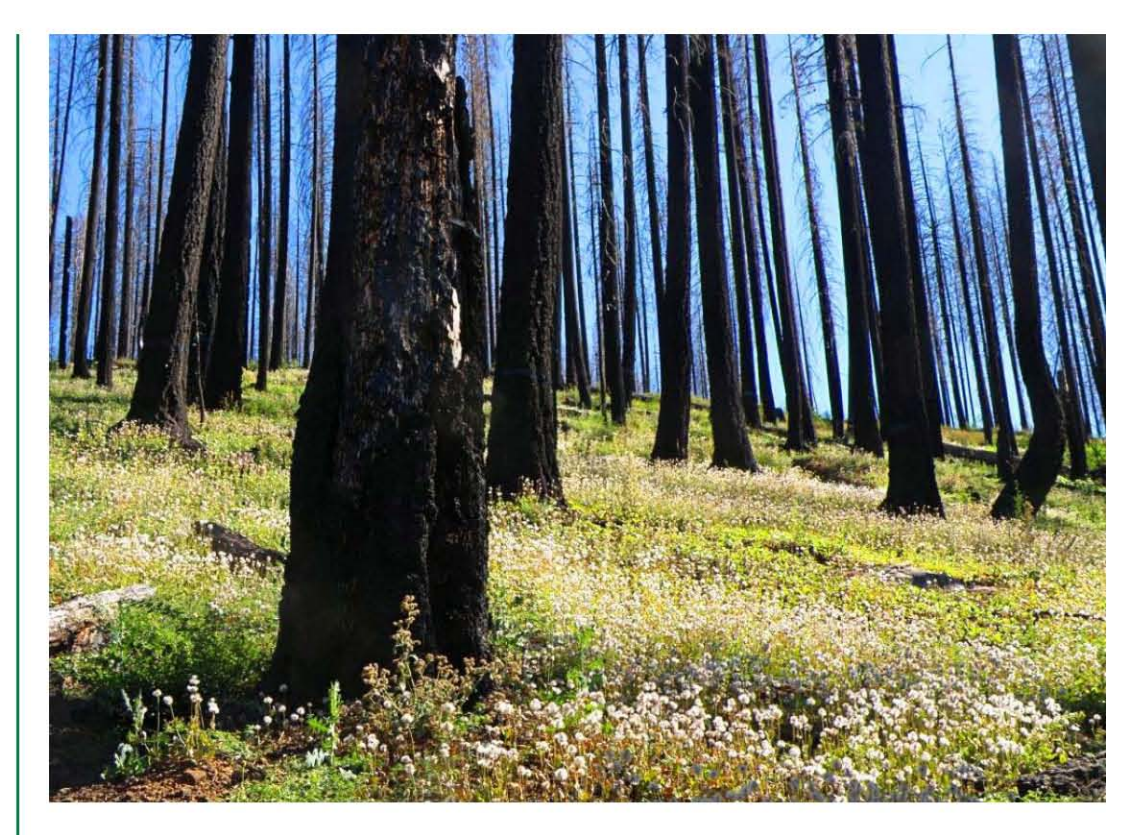
Fig. 10. A recent snag forest patch in the Sierra Nevada.