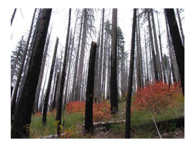
Fig. 6. Snag forest habitat increases the Spotted Owl's small mammal prey and provides foraging habitat for Spotted Owls.

Recent scientific evidence regarding spotted owls in northwestern California and in Oregon found that stable or positive trends in survival and reproduction depended upon significant patches (generally between one-third and two-thirds of the core area) of habitat consistent with high-intensity post-fire effects (e.g., native shrub patches, snags, and large downed logs) in their territories because this habitat is suitable for a key owl prey species, the Dusky-footed Woodrat (Franklin et al. 2000, Olson et al. 2004). This habitat is not mimicked by logging, which removes snags and prevents recruitment of large downed