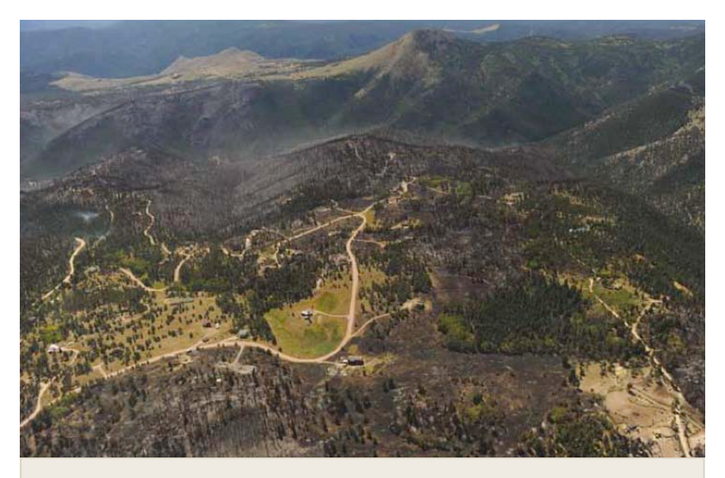
Aerial view of the Fourmile Canyon area. Steep slopes, dense ponderosa pine and Douglasfir forest, and mixed-land ownership characterize this wildland-urban interface zone near Boulder, CO.

In September 2010, three years after data had been collected from the formal surveys, a wildfire ignited in Fourmile Canyon in the foothills west of Boulder. By the time the fire was contained eleven days later, it had destroyed 169 homes, making it the most destructive fire in