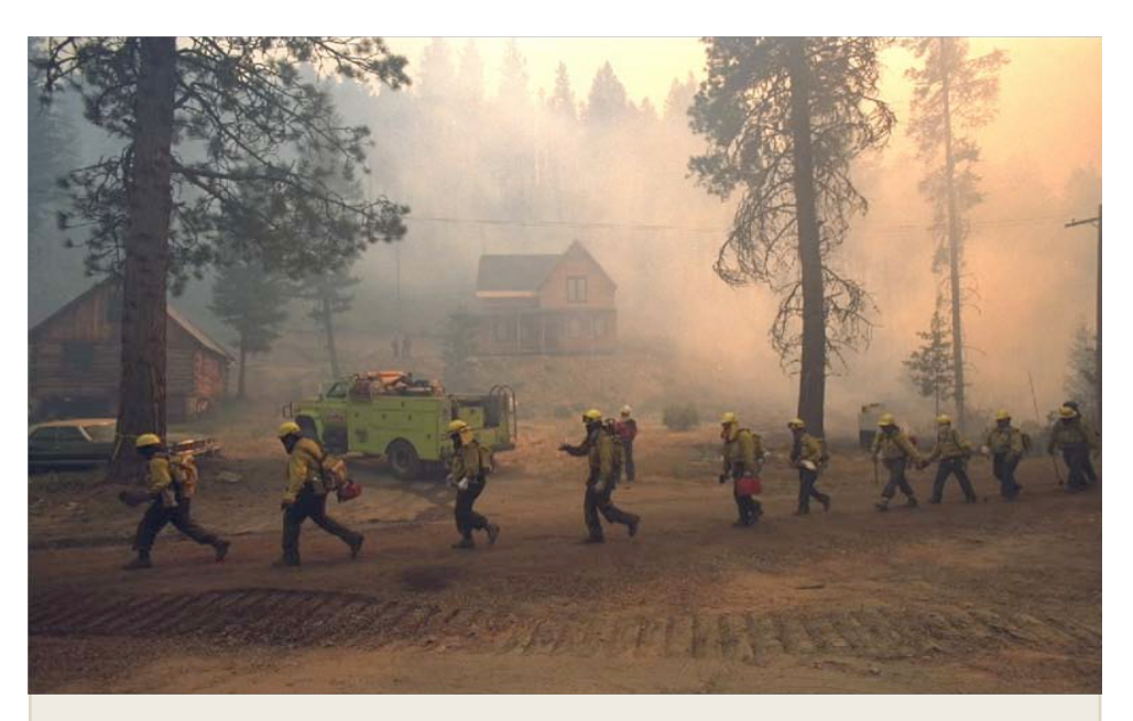
The financial costs of fighting fire in the WUI are enormous – in one survey of land managers, they estimated that between 50 and 95% of firefighting expenditures were attributable to defense of private property.

In the most fire-prone areas of the country, new homes are being built faster than ever. It is <u>estimated</u> that between the years 1990 and 2008, there were roughly 17 million new homes built in the United States, of which 10 million (or 58%) were located in the "wildlandurban interface" (WUI)—the term for forested areas into which communities are expanding. The <u>financial costs</u> of fighting fire in the WUI are enormous: One survey of land managers estimated that between 50 and 95% of firefighting expenditures were attributable to defense of private property. The tragic, recent