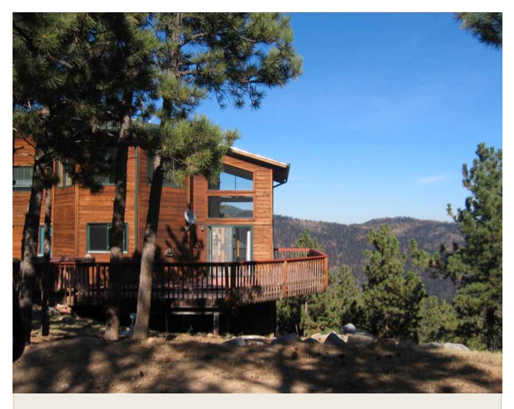
Many property owners enjoy the scenic views offered by ridgetop locations and nearby forest vegetation, but these are major risk factors that become a liability during wildfire.

Another reason for optimism is that over the past decade, communities seem to be awakening to the need for wildfire mitigation. For example, in the recent past it was common to find covenants in place that required architectural committees to approve removal of trees in WUI neighborhoods, according to Hannah Brenkert-Smith, which would be a barrier to mitigation action. She observed that since then, "Although we have not researched this specifically, it seems to have become much more likely that an HOA in the WUI will encourage and facilitate vegetation reduction." Also, the infamous Hayman