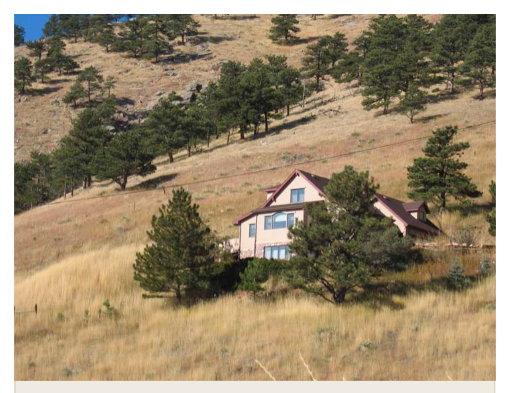
It is estimated that between the years 1990 and 2008, there were roughly 17 million new homes built in the United States, of which 10 million (or 58%) were located in the "wildland-urban interface" (WUI).