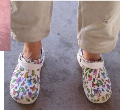
Marilynn Szydlowski models the latest in après project footwear.