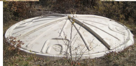
The collection device