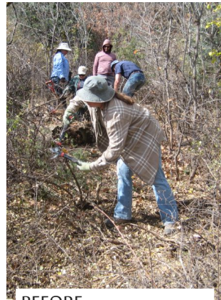
BEFORE — overgrown paths tough to navigate...