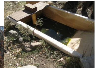
The water trough