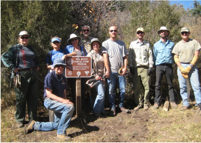
Most of the group gathers for a photo op.

Our final project of the year put us on the east side of the Sandia Mountains, rehabilitating the site of previous Habitat Stamp Program work. The area around this wildlife drinker, previously an open meadow, had become overgrown with dense underbrush and some large trees. Guided by the USFS, we sawed, lopped, and nipped away at the long grasses and interwoven shrubs, to clear the paths from forest to drinker for the many deer, bear, and other animals in evidence. Some new shrubs were planted to replace the large trees being felled by chain saw. Our tasks complemented efforts by Friends of the Sandia Mountains volunteers, who had "discovered" the drinker and had cleaned up the catchment and water trough.