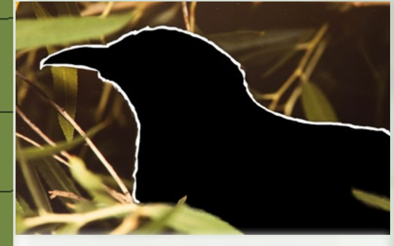
Once home to a thriving population, the species has disappeared from the Pacific Northwest.