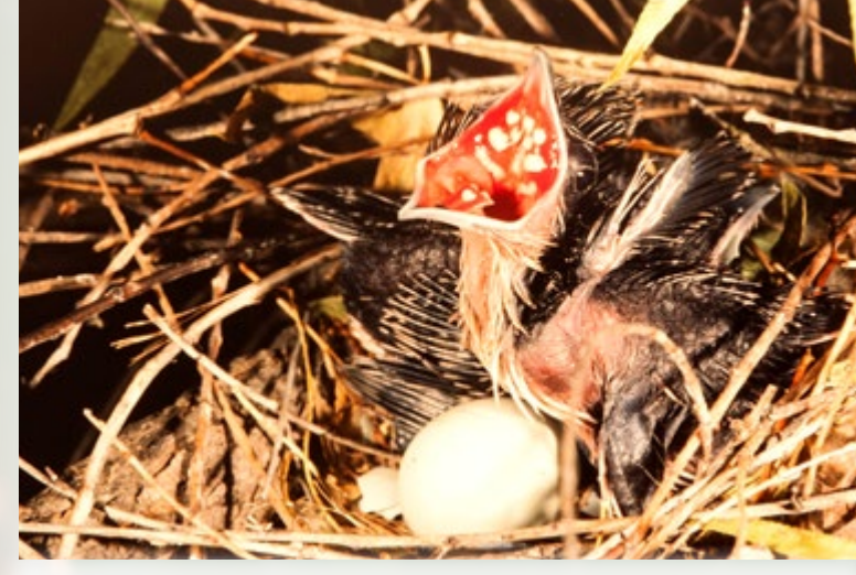
Most remaining populations are so small, random events such as floods, fires and disease could wipe them out.