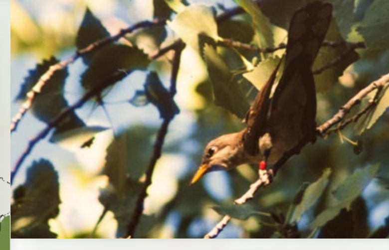
The biggest threat facing the western yellow-billed cuckoo is habitat loss. Over 90% of its habitat along streams and rivers has been lost or degraded due to human caused alteration of the hydrology.

A neotropical migrant bird, the western yellow-billed cuckoo winters in South America and breeds in North America. Once soaring in numbers, the species is at an all-time low.